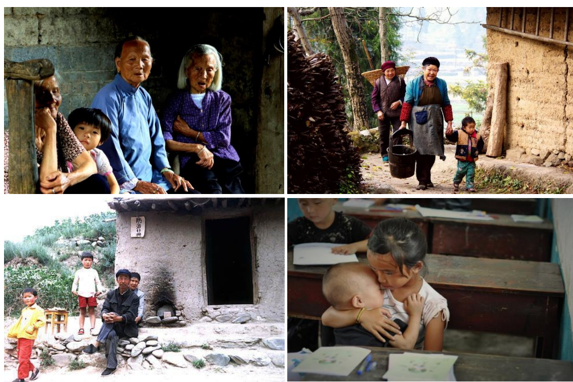
Figure 3. Left-behind children and elders