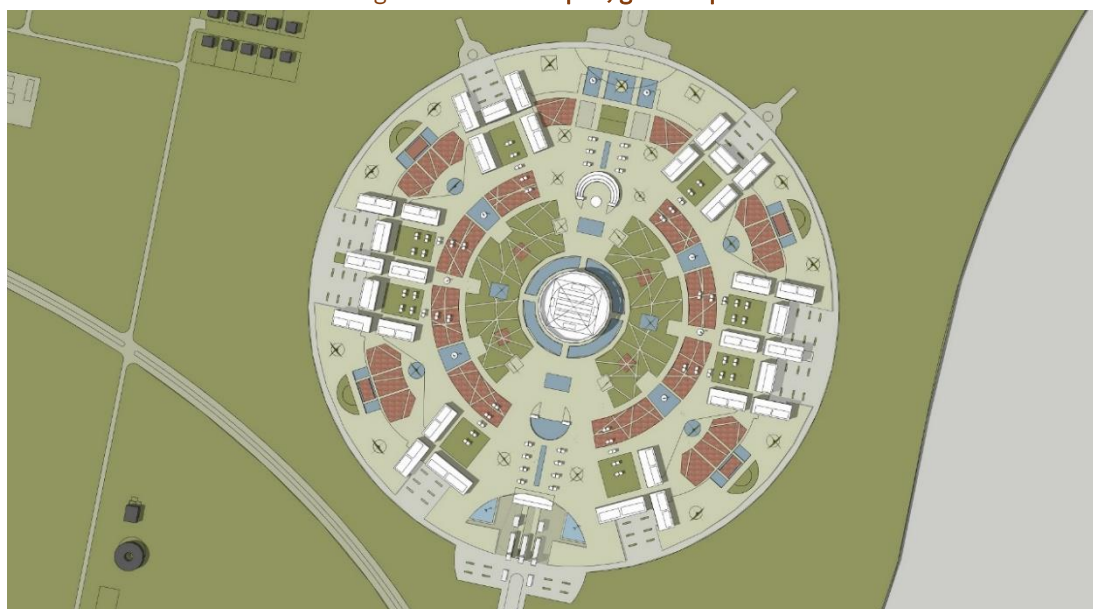
Figure 6. UAN Campus, general plan