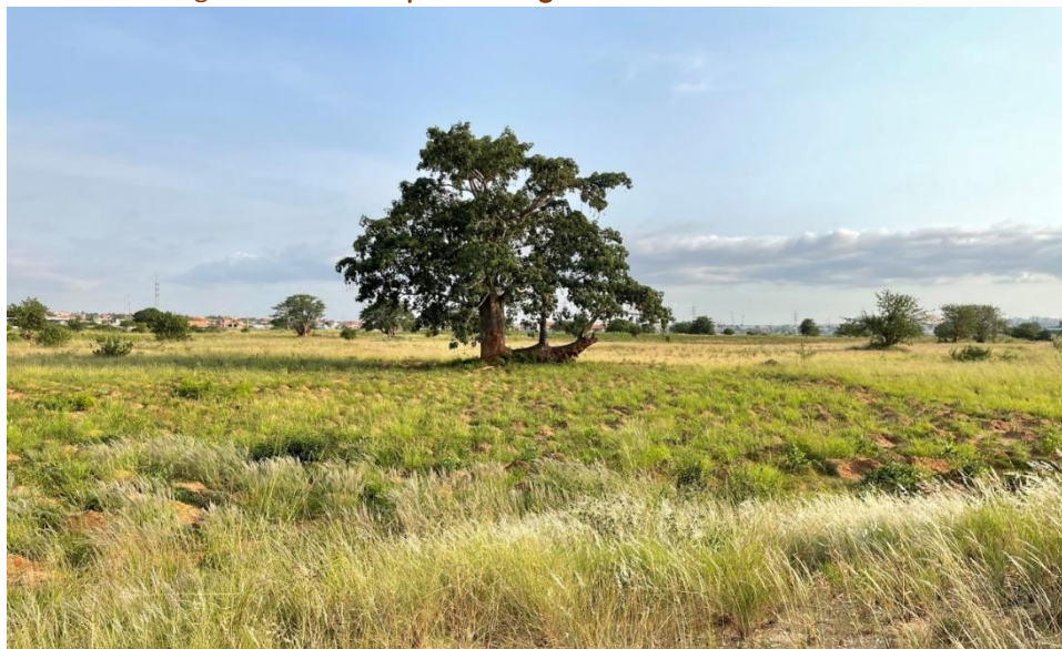
Figure 5. UAN Campus site – general view and baobab tree