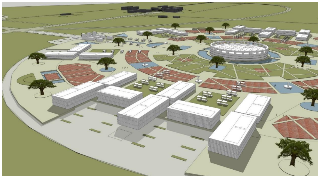
Figure 9. UAN Campus, aerial perspective from the East