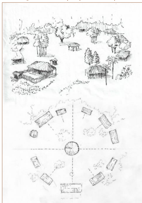
Figure 1. Kimbo, perspective and plan