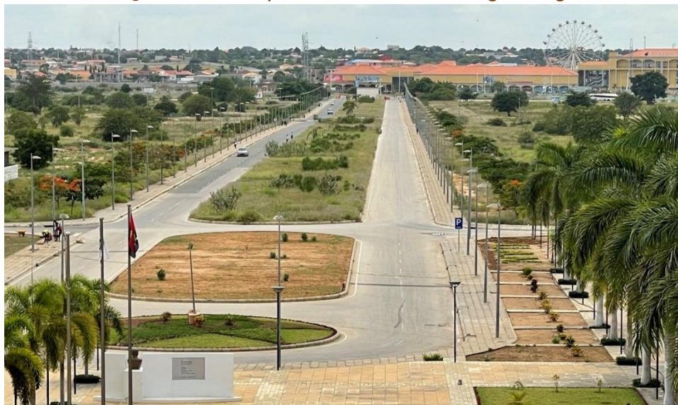
Figure 4. UAN Campus site – view from existing buildings