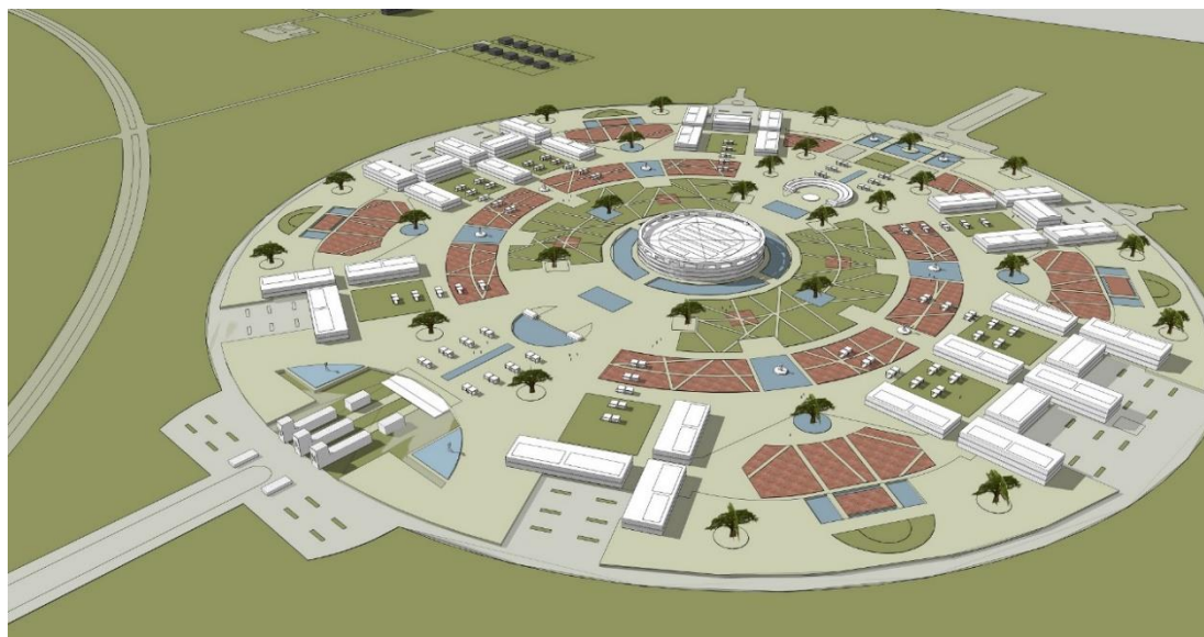
Figure 7. UAN Campus, aerial perspective from the Southeast