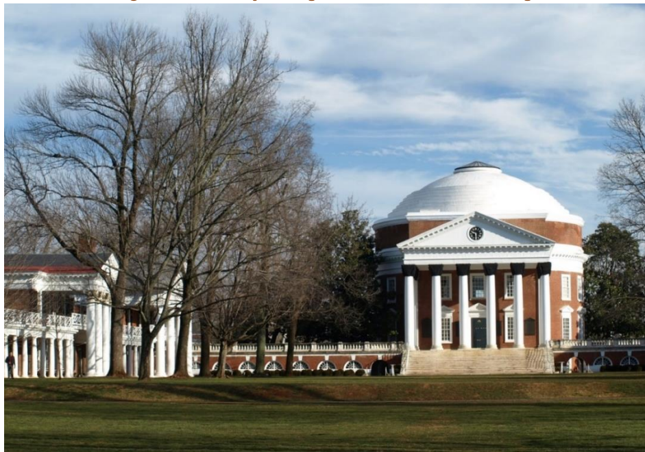
Figure 2. University of Virginia – The Academical Village