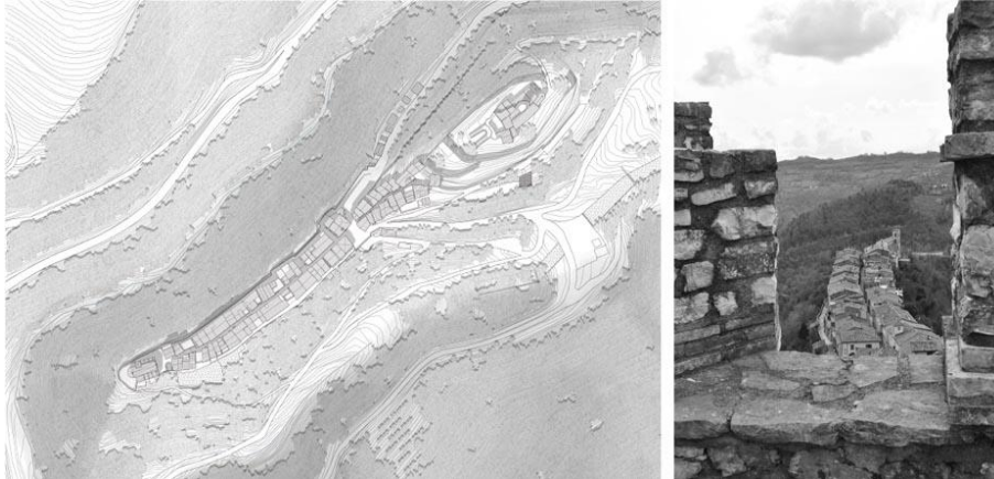
Figure 2. General Plan of Montenero Sabino and view from the Orsini castle