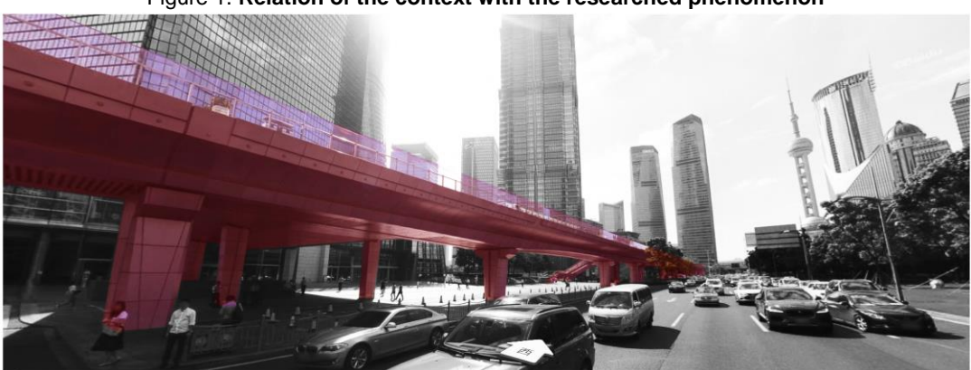
Figure 1. Relation of the context with the researched phenomenon