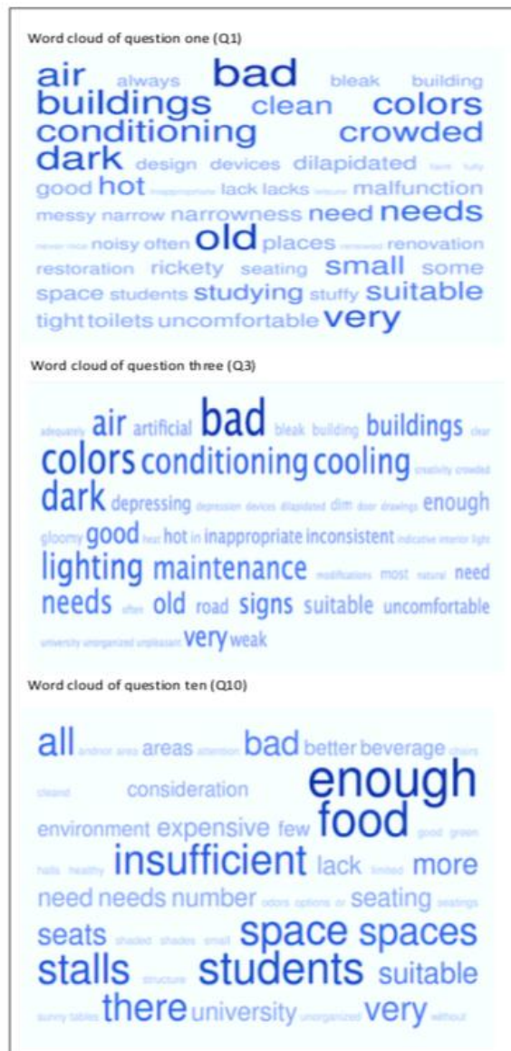
Figure 2. Word clouds generated from students' responses