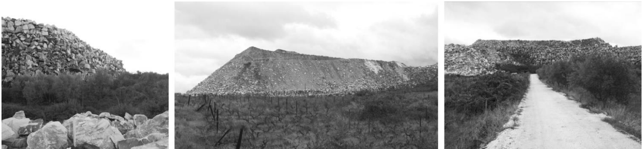
Figure 1: “ Escombeiras ”, huge piles of marble remains.

For all these reasons, the marble is used only in small amounts in several industries and for building use, road-paving material, production of artificial aggregates and soil pH corrections. The remaining portion of it persists in the landscape to “deface” it since the huge mounds of wastes cannot be placed outside the area due to budgetary limits. Many costs can be added either concerning the transport of this residual material to landfills, nearby or far away, or about the work of the individual manufacturing operators.