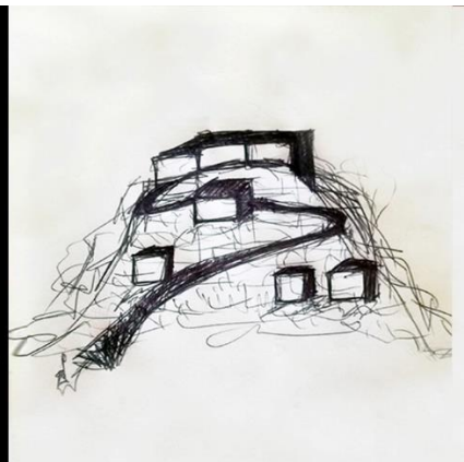
Figure 2b. Building on the Escombreira .