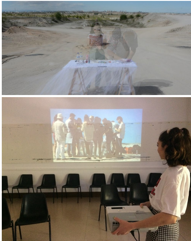
Fig. 6 Site - Non site AH Lab. Collective's actions.