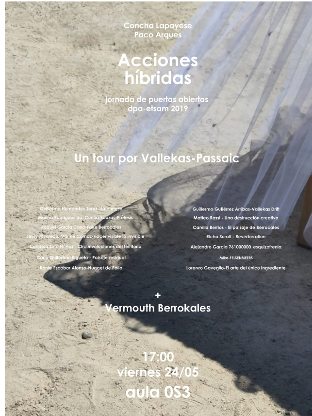
Fig. 7 Un Tour por Vallekas-Passaic. Vermouth Berrocales.