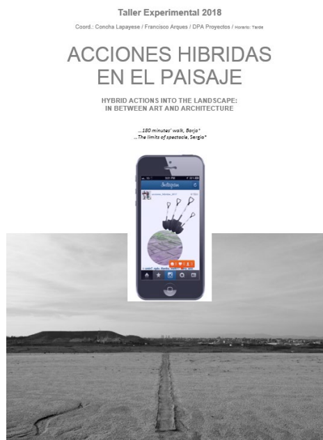
Fig. 5: AH Lab. 2018.